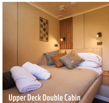
Upper Deck Double Cabin