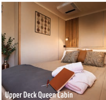
Upper Deck Queen Cabin