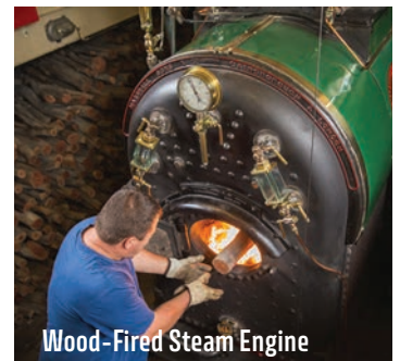
Wood-Fired Steam Engine