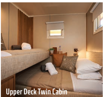
Upper Deck Twin Cabin