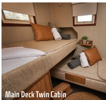
Main Deck Twin Cabin