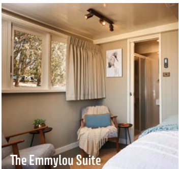
The Emmylou Suite