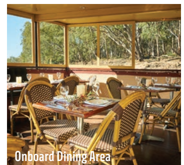
Onboard Dining Area