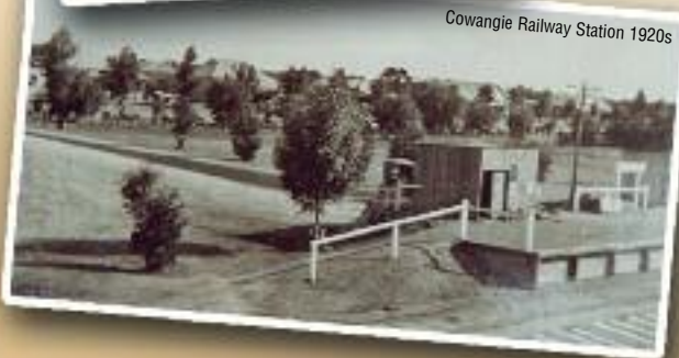
Cowangie Railway Station 1920s