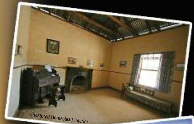
Restored Homestead Interior

A further Public Heritage grant was received in 2002 which enabled the collapsed cookhouse to be rebuilt mainly from original materials. The sundial, privy, part of the stable and windmill were erected in 2002.