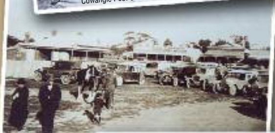
Better Farming Train 1928-29