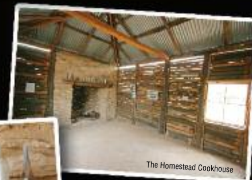
The Homestead Cookhouse

Access to Kow Plains Homestead through front gate beside information box and sign. Group tours can be arranged. Ph (03) 5095 6285 www.kowplains.com