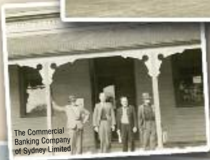
The Commercial Banking Company of Sydney Limited