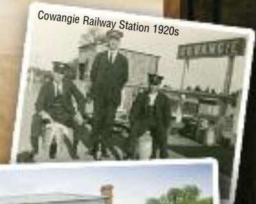
Cowangie Railway Station 1920s