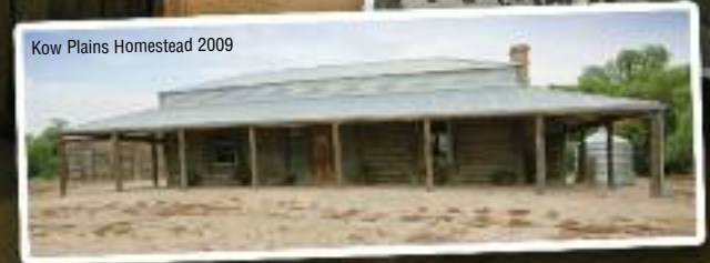
Kow Plains Homestead 2009