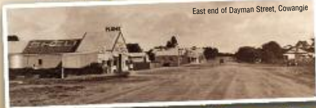
East end of Dayman Street, Cowangie