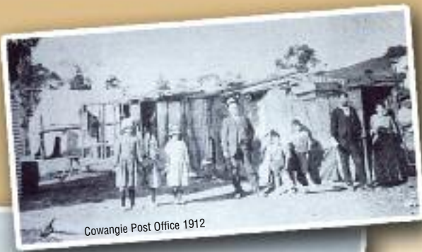
Cowangie Post Office 1912